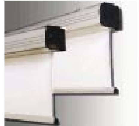
Fixing Brackets are supplied

Low voltage interface (LVI) False Ceiling Suspension Kit