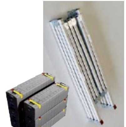
Snap fit - no tools required

Anti-Sway Braces - Provides additional stability and prevents lateral movement