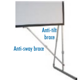
Anti-tilt brace Anti-sway brace

MONOBLOX 64 - the professional choice from Harkness Screens