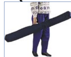
Supplied complete with carrying case.