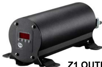
Z1 OUTDOOR (IP65)