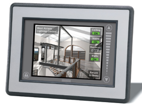
ND-CT320-TFT CueTouch LCD Panel