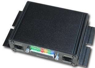
CS-810 Mini Processor