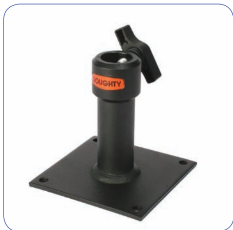
Junior Wall Plate