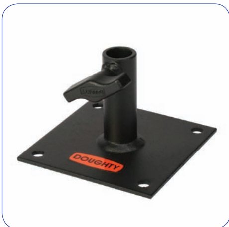
Baby Receiver Wall Plate

A 120mm x 120mm plate with a 29mm receiver and corner fixing holes