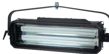
Studio Cool 2