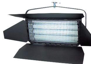
Studio Cool 4 with Egg Crate & Barndoor