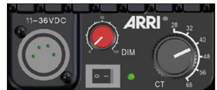
LoCaster operation panel