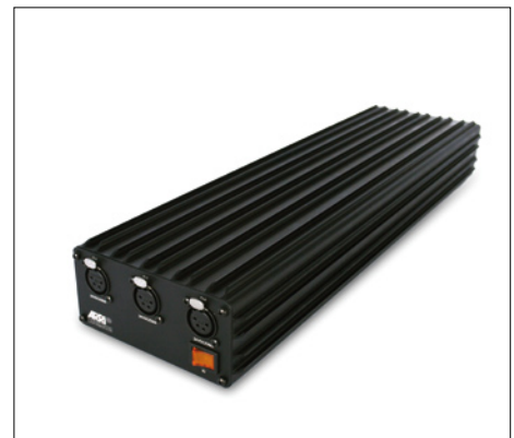
Caster Series Power Supply 300W/24VDC, front side