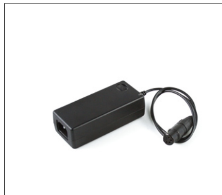
Caster Series Power Supply 60W/24VDC