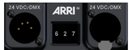
BroadCaster operation panel