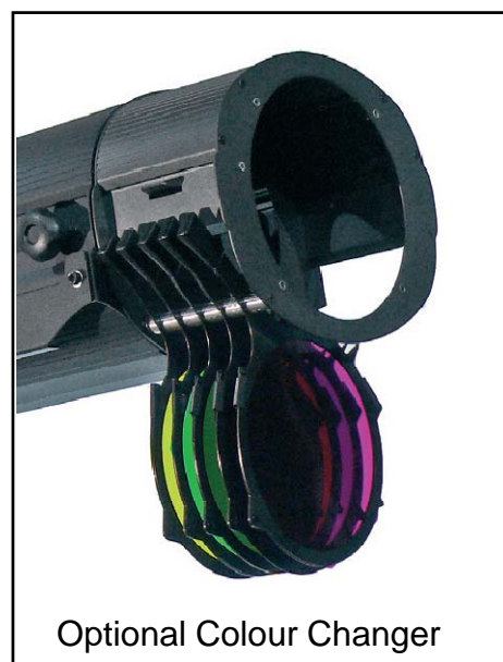
Optional Colour Changer

Preliminary information - D.T.S. reserves the right to make any functional or design modification to any of its products without any prior notice.