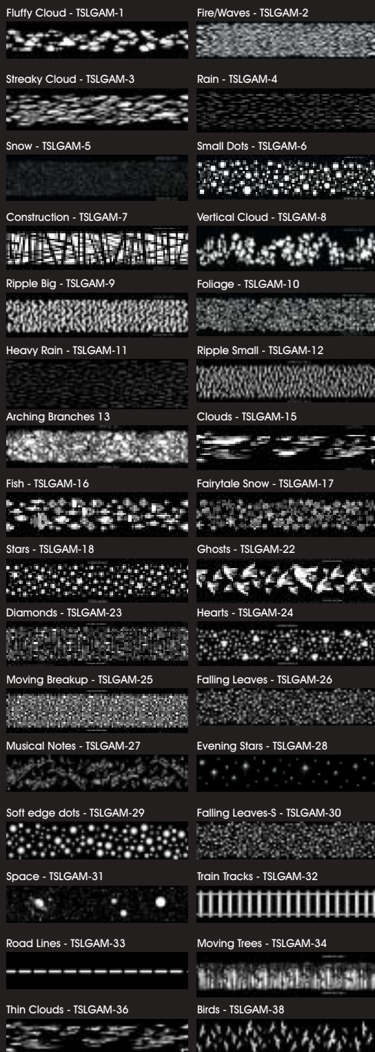
Fluffy Cloud - TSLGAM-1