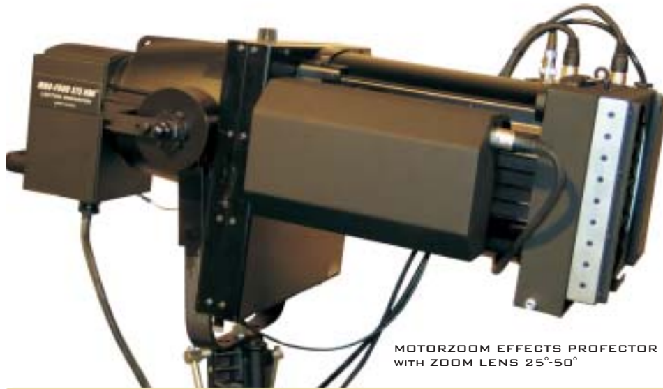
MOTORZOOM EFFECTS PROJECTOR WITH ZOOM LENS 25°-50°

Never before has there been so much punch in such a small package. But not only do you want your effects to stand out, you also want to control them.