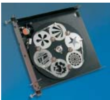
Slide-in modul with 6-gobo tray