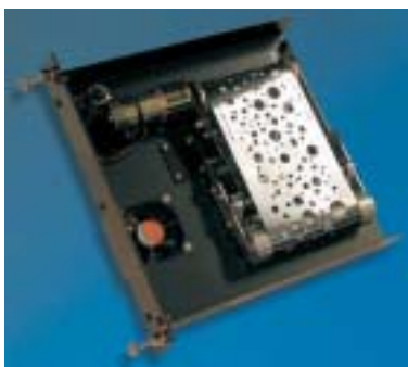
Slide-in modul with filmdrive

Smoothly fade in your high intensity daylight beam - gradually soft focus - zoom out to 50° - and cut to blackout! You have never had so much control!